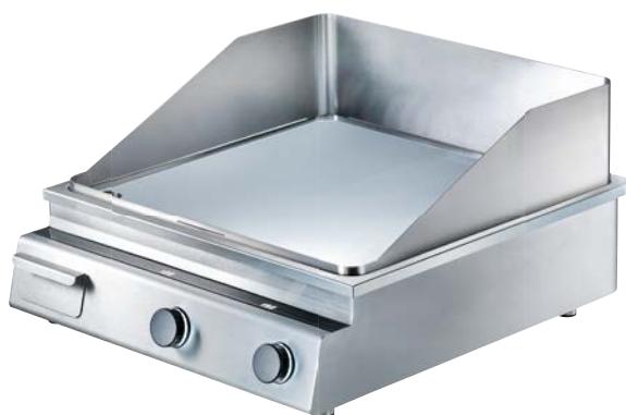
INSTINCT Griddle 10