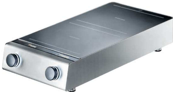
INSTINCT Hob 10